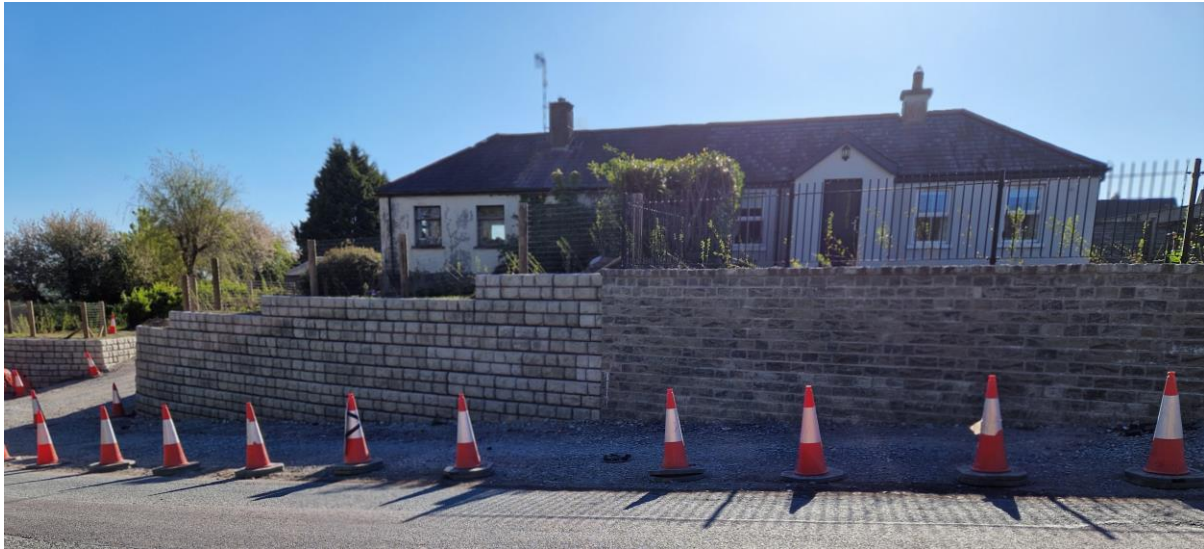
Boundary walls on Pouladuff Road.

From 5 th May 2026, we envisage working in the following areas: