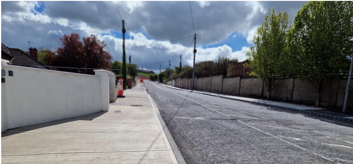
Recently constructed footpaths on Togher Road.